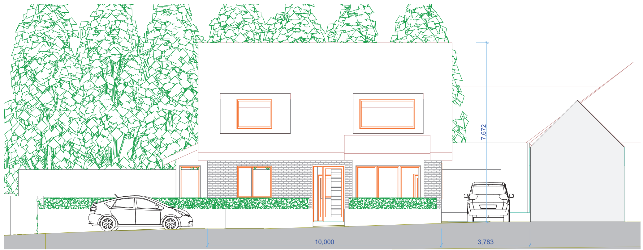
Section through access road, West Elevation